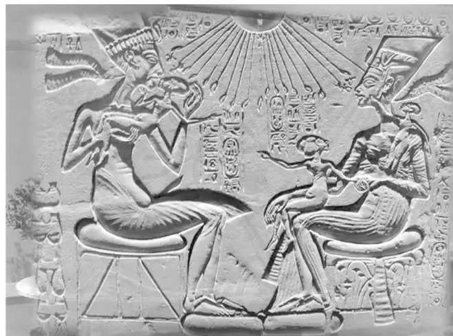
Fig. 1. An image showing Akhenaten, Nefertiti and three children exposing themselves and a house plant to the healing rays of sunlight. The religious symbols in the image suggest that the Ancient Egyptians venerated and worshipped the sun.

The Greeks and the Romans clearly recognized the healing power of the sun. They built solariums and sunbaths, and the Greeks even used them to enhance the strength of athletes preparing for the Olympic Games by exposing them to several months of sunlight treatment. The word, heliotherapy, actually derives from the Greek name for their sun god, “Helios”; heliotherapy meaning sunlight therapy [23–26]. Furthermore, Ayurvedic medical records show that as far back and 1400 BCE; Hindus used the combination of sunlight and photosensitive herbs, such as furocoumarins, to treat vitiligo and other conditions—a combined treatment, which many refer to today as photodynamic therapy [27]. Moreover, records indicate that heliotherapy was a